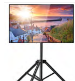
42" LED TV with Stand (Per Day)