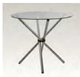
Glass Round Table