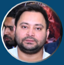
TEJASHWI YADAV Deputy Chief Minister of Bihar

TTF's debut in Bihar is a milestone. We aim to showcase Bihar's rich culture, religious sites, and spiritual tourism. Our tourism board works tirelessly to provide top-notch infrastructure. Hosting TTF annually will foster knowledge exchange, benefiting the travel and tourism sector nationwide.